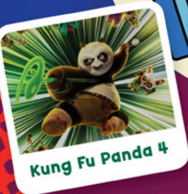
Kung Fu Panda 4