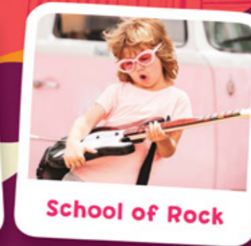
School of Rock